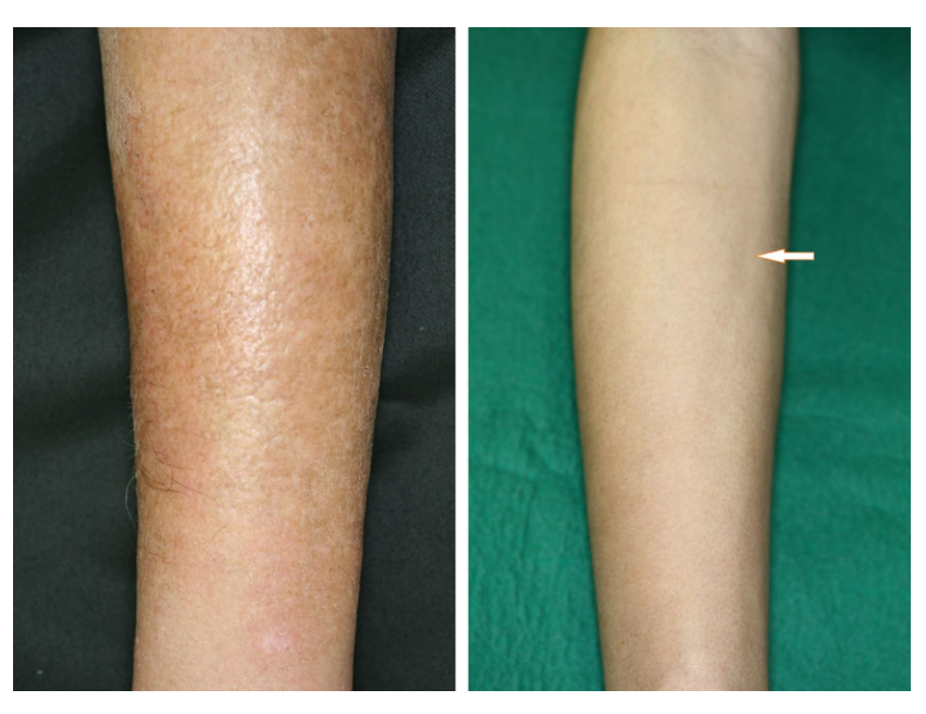
Figure 2. Clinical findings of the orange peel-like appearance and groove sign of eosinophil fasciitis.